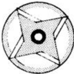
Fig. 6 Windmill Throwing Star (10 points)