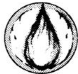
Fig. 8 Fire Wheel (8 points)