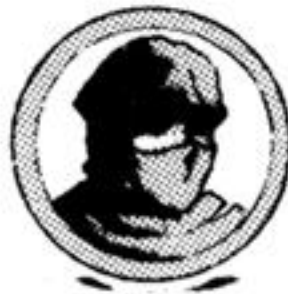
Fig. 4 1 UP