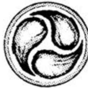
Fig. 10 Invincible Fire Wheel (20 points)