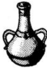
Fig. 2 Recovery Medicine