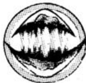
Fig. 9 Vacuum Wave (10 points)