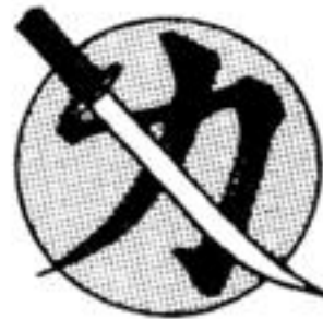
Fig. 5 Dragon Spirit Sword